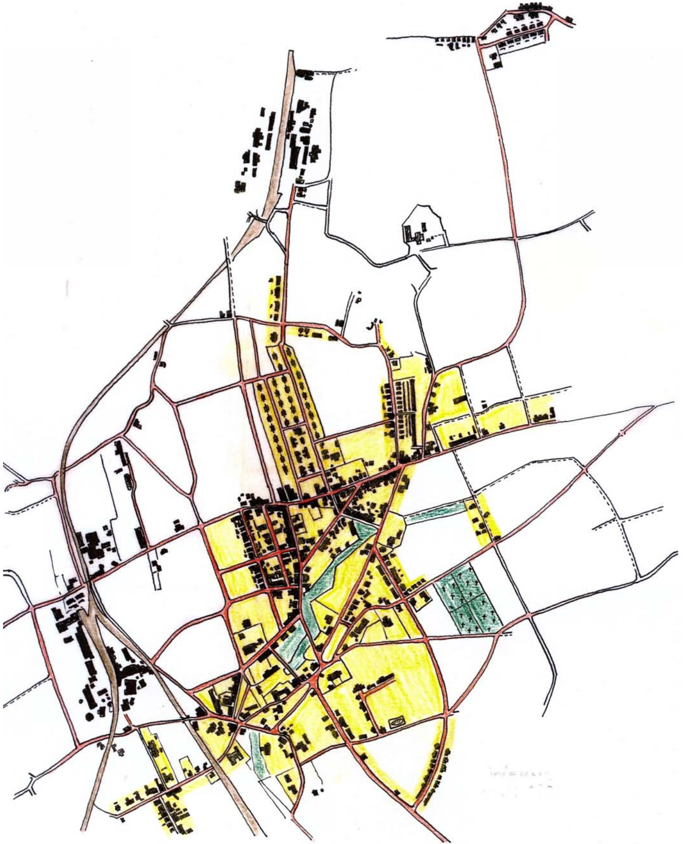
Situation nach 1910